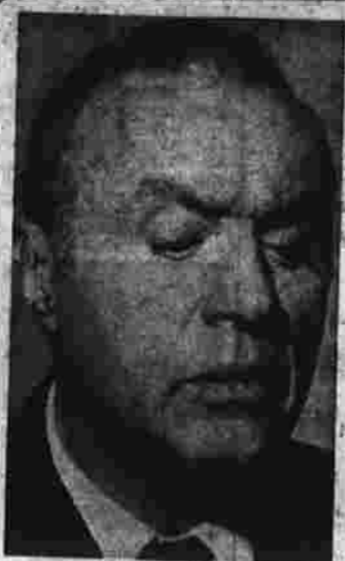
Charles Boyer will be narrator on NBC's "The Louvre," an hour-long visit to the Paris museum, Tuesday at 10 p.m.

NEW YORK (AP)—NBC has decided to drop two of the three comedies pulled together under the title of "90 Bristol Court." The first, "Karen," will remain its Monday night schedule, but "Harris Against the World" and "Tom, Dick and Mary,"