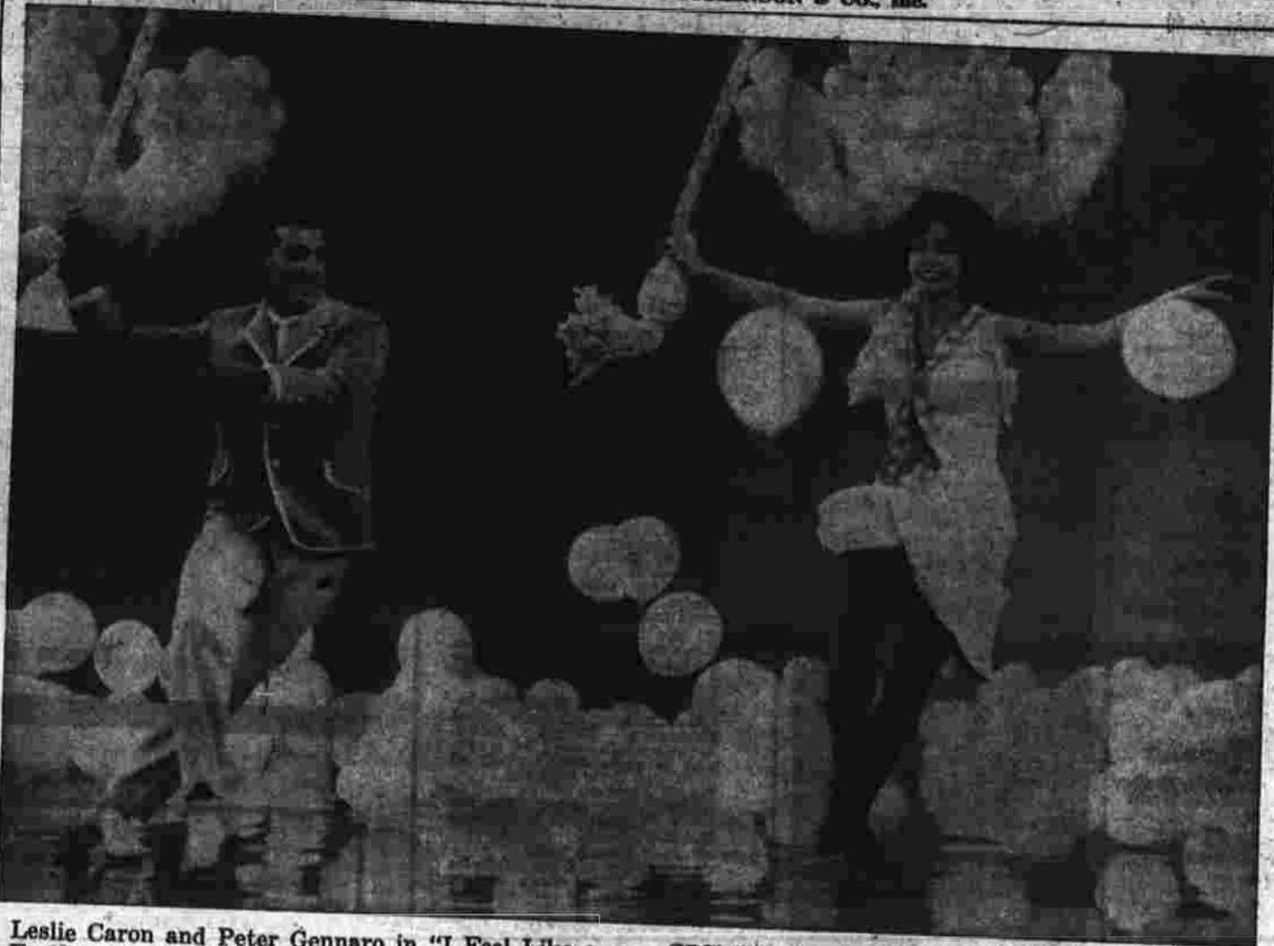
Leslie Caron and Peter Gennaro in "I Feel Like a Feather in the Breeze," one of the numbers in